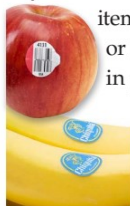
Fruit stickers come in many shapes, colors, and sizes.

If you want to start a collection, you don't have to look far. You can start in your own house with common