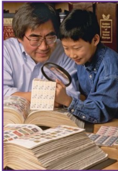
As his father looks on, a boy uses a magnifying glass to look closely at a stamp.

Stamps, coins, masks, and dolls are some of the most popular things people collect. These items are easy to find, and there are many different kinds. People can collect coins or stamps from one country or from many countries around the world.