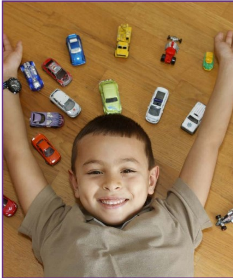
It can be fun to count how many items you have in your collection.

A collection is a group of objects that are alike . People collect all sorts of things, such as rocks, stickers, cars, and even dirt from different places!