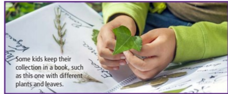
Some kids keep their collection in a book, such as this one with different plants and leaves.