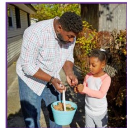
This girl and her father gather leaves for her collection.

Collections can be big or small. You might have one hundred trading cards or ten comic books.