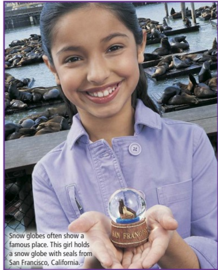
Snow globes often show a famous place. This girl holds a snow globe with seals from San Francisco, California.

Some people collect things from places they have visited. When they travel somewhere new, they buy a souvenir . It might be a plate, key chain, or snow globe with the name or picture of the place.