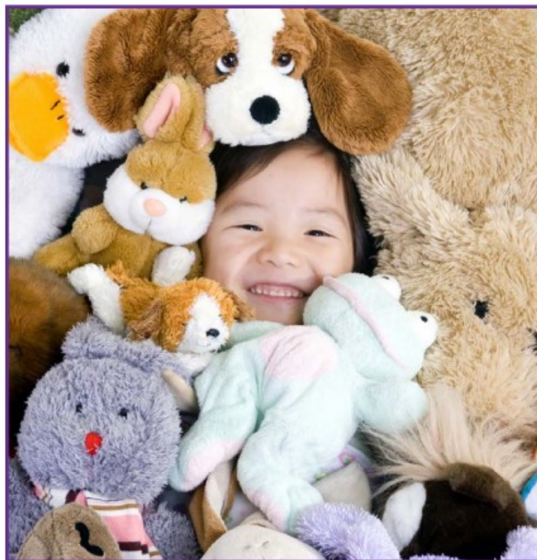
Stuffed animals are one of the most popular items collected by kids—and adults!