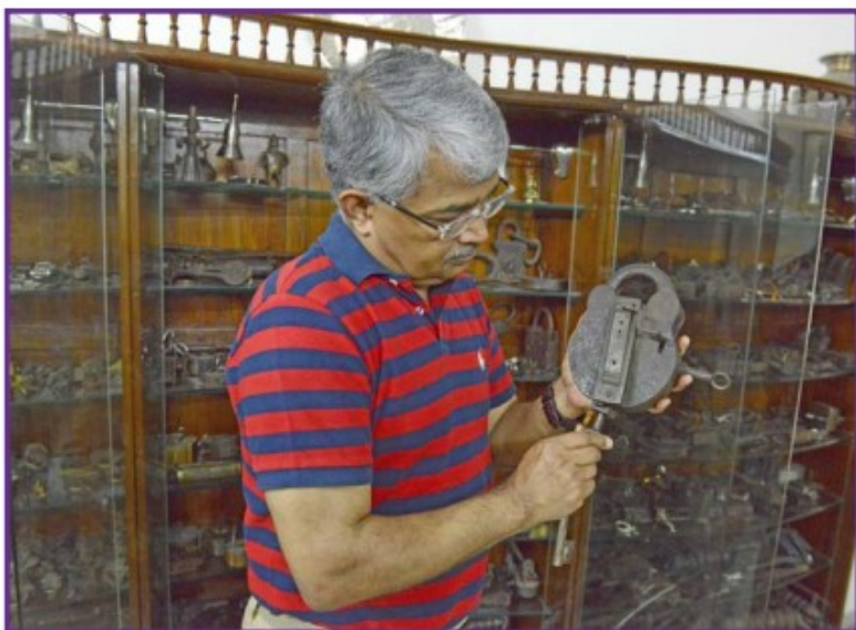
This man shows one of the 750 locks in his collection. His locks are from India and are between one hundred and six hundred years old.

It takes time to build a collection. It can be rewarding to find an item that you've been looking for, such as a particular lunch box. Some people enjoy having to work hard to add to their collection.