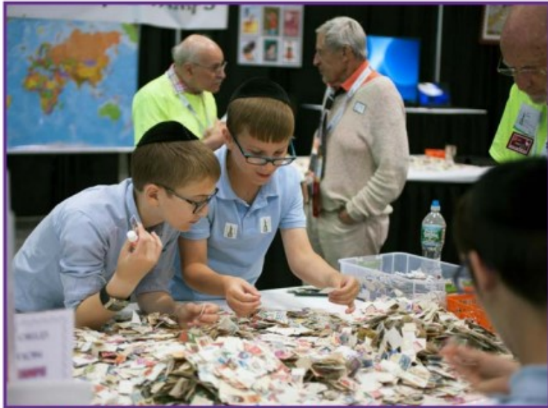
Two boys choose stamps to add to their collections at the 2016 World Stamp Convention in New York City.

Collecting can bring people together. Meeting and talking to people who collect the same things can help you learn more about your collection. You can also buy, sell, and trade parts of your collection.