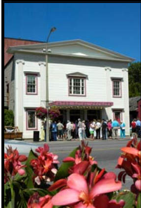
Royal George Theatre