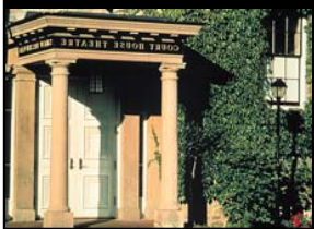
Court House Theatre