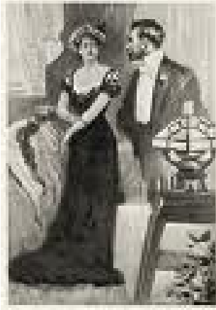
You brute! You coward! anonymous artist's illustration

The première of An Ideal Husband was at London's Theatre Royal Haymarket on January 3, 1895, directed by Lewis Waller, who also played Sir Robert Chiltern. The production transferred to the Criterion Theatre on April 13, 1895, but was withdrawn on April 27, the day after Wilde's trial for "gross indecency" began. There have been numerous British revivals of the play, prominent among them Peter Hall's long-running production in the mid-1990s, which ran in various provincial and London theatres with casts that included Simon Ward, Martin Shaw, Richard Todd, and Kate O'Mara. Hall's production opened on Broadway at the Ethel Barrymore Theatre on May 1, 1998, and ran for 307 performances.