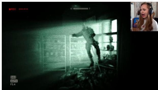
Fig. 1. One of the many jump scares of the Outlast Asylum Affect Corpus , depicting in-game visuals and face cam of YouTube user AnidaGaming. Image used with the streamer’s permission.

This project has received funding from the European Union’s Horizon 2020 programme (grant agreement No 951911).